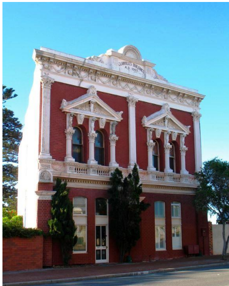
Glanville's Buildings on Canning Highway, East Fremantle

Smith Street Fitzroy 1888 ( Australasian Builder and Contractors' News , 22 September 1888)