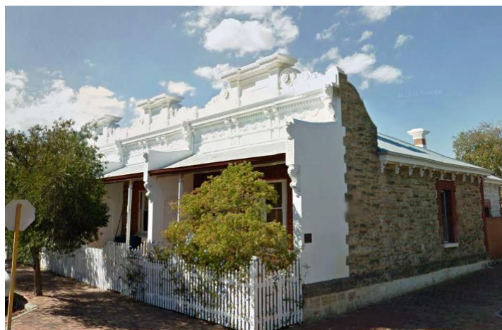
Attached housing at 46-52 King Street, East Fremantle