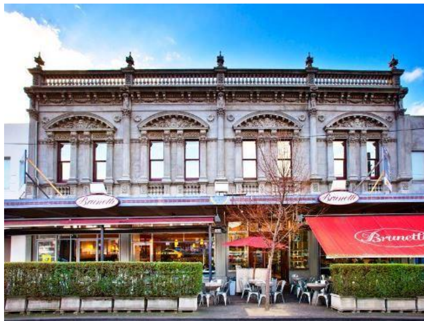
Shops and residences at 198-204 Faraday Street, Carlton of 1886 ( http://www.commercialrealestate.com.au/property/7754871/for-lease/vic/carlton/retail )