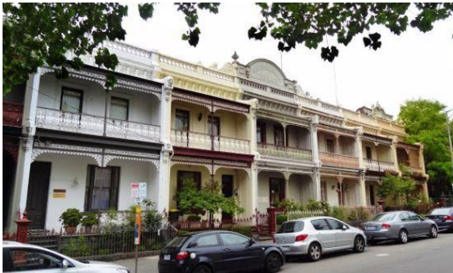
Melbournia Terrace 1-13 Drummond Street, Carlton of 1877